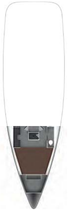
Owner's version after modification of the charter version