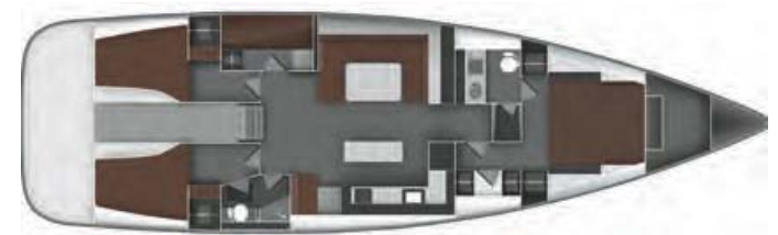
4-cabin version A